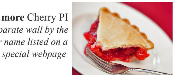
Pledge $500 or more Cherry PI Your name on a separate wall by the machine and your name listed on a