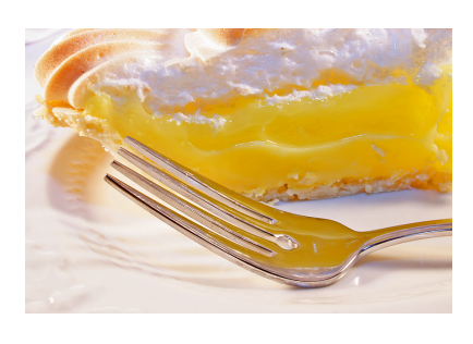
Pledge $100,000 Lemon Merengue PI

(20 Limited Offer) Your name on a special plaque on the side of the PI wall and your name listed on a special webpage